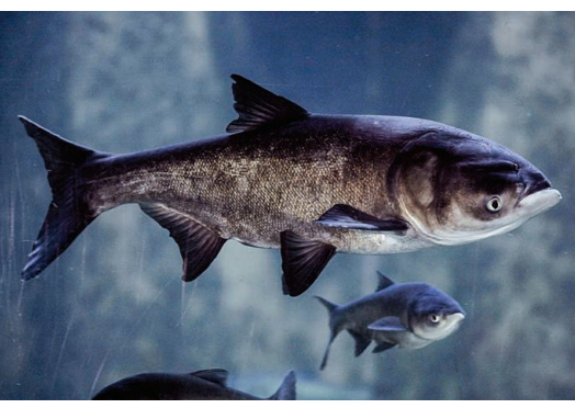
Bighead carp threaten native species in China.

Aquaculture in Asia is increasingly reliant on the farming of alien species, whether stocked from other countries or intentionally translocated from remote water basins within the same nation (1). Recent estimates suggest that more than 100 alien species of freshwater finfish are farmed in China (2). Many of these species have become widely established in the wild either as a result of escape from aquaculture ponds or through deliberate introductions into lakes and freshwaters to enrich wild fisheries. Unfortunately, the consequences have usually been disastrous. Several alien finfish