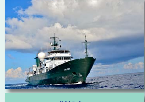
R/V Falkor